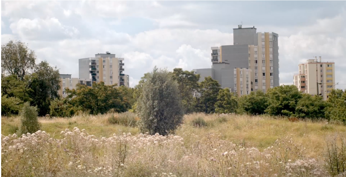
Alice Diop, Nous , 2021

Studio Paris will be a four-day event dedicated to work in, and within, the context of the Greater Paris Region. In addition to training on alternative methods to both analyze and interpret rural-urban place-making in relation to mobility, the studio aims to strengthen collaboration within the TOD-IS-RUR network, and the partner organizations more specifically, as well as reflect on the ESR projects, in relation to insights gained from the Greater Paris Region. The program is defined by three main aims: